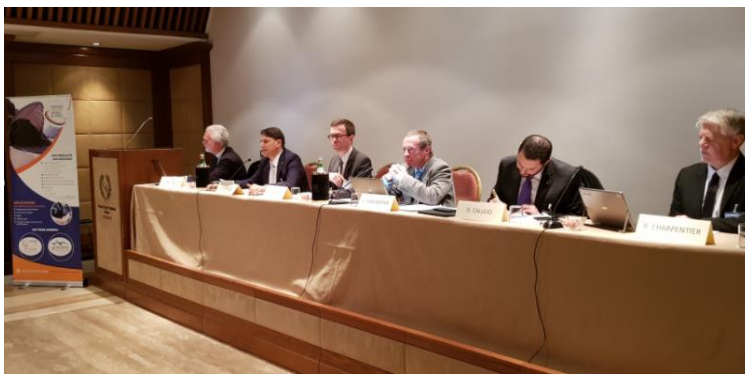
PIARC Mid-Term meeting – Rome - December 4-6, 2017