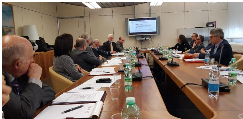
Meeting of Presidents/Vice Presidents of the Technical Committees and Task Forces of the Italian national Committee– Rome - January 26, 2018

conomic and organizational commitment. The Presidents and Vice-Presidents then illustrated a brief presentation of the activities and work carried out the first 2 years and that should be concluded, as in PIARC international, in December 2018 with a final report that each will present at the National Meeting to be held in April 2019. The following topics were also discussed: the PIARC calendar 2018-2019, the following steps for the PIARC World Congress in Abu Dhabi, the format of the PIARC Italy National Meeting, the Italian participation to the international Technical Committees, the editorial activity (ex. Manuals, etc.), the use of PIARC Italy online manuals, the new themes to propose for the next cycle, sponsorships, the internal organization of the Technical Committees/Task Force and the functioning of the website www.aipcr.it with its sections dedicated to the work of the Committees.