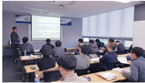
2017 PIARC Korean National Committee Technical Committee Workshop