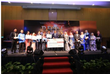
The Minister of Works Dato’ Sri Haji Fadillah bin Haji Yusof (centre) and PIARC First Delegate and REAM President Dato’ Sri Ir. Dr. Roslan bin Md Taha (right) with recipients of financial aid and President’s Award.

REAM hosted the REAM Gala Dinner on 20 January 2018. This memorable event was graced by the Minister of Works, Malaysia Dato’ Sri Haji Fadillah bin Haji Yusuf. The objective was to provide an avenue for fostering and further strengthening professional and personal ties in the spirit of camaraderie amongst the road engineering fraternity. The highlight of the event was the presentation of financial aid under the REAM Education Fund and the President’s Award.