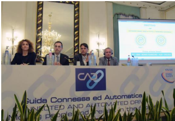
International Conference “Connected and Automated Driving – Moving People and Freight in the Future” – Rome - October 13,2017